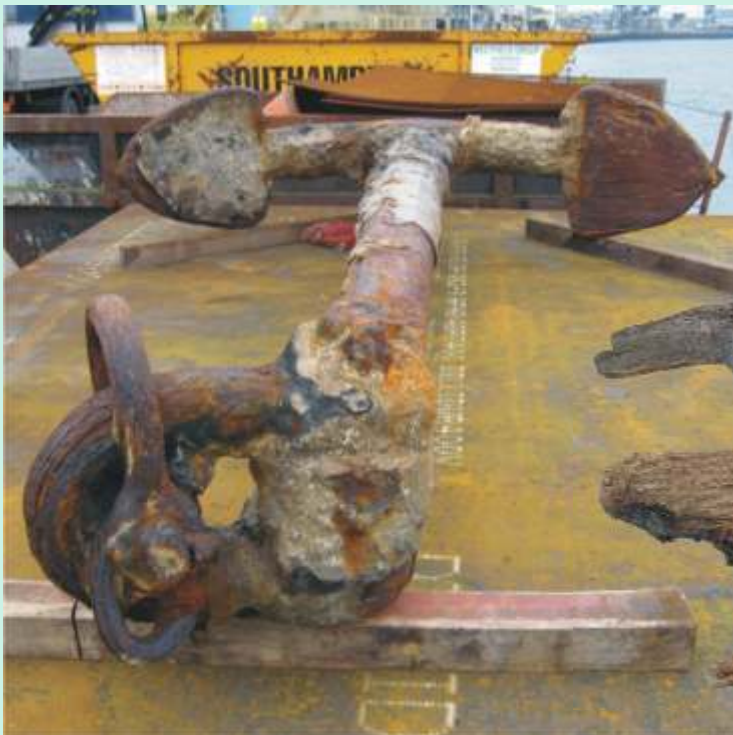
Left: Large Admiralty type anchor (Hanson) Below: Ships timbers (UMA and CEMEX)

These establishments provided pre-sea training facilities for boys, preparing them for service in the Royal Navy. The training establishments used the hulks of old warships for accommodation and class room space and it is possible that these brass finds may derive from one of these vessels. As the brass plate refers to electric light, the vessel is unlikely to date from before the early 20th century.