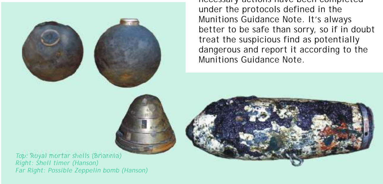
Top: Royal mortar shells (Brianma) Right: Shell timer (Hanson) Far Right: Possible Zeppelin bomb (Hanson)

So please remember that if you find any munitions, other than cannon balls, they should only be reported through the Implementation Service once the necessary actions have been completed under the protocols defined in the Munitions Guidance Note. It's always better to be safe than sorry, so if in doubt treat the suspicious find as potentially dangerous and report it according to the Munitions Guidance Note.