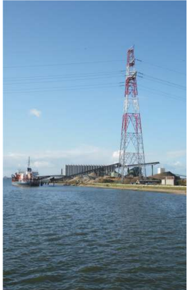
Kallo Wharf, Antwerp, Belgium