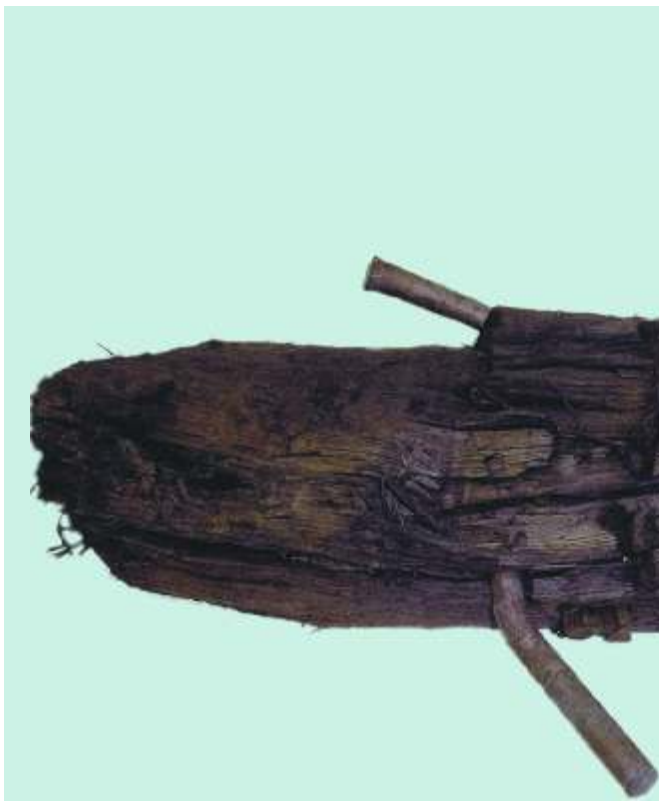
Above: MG15 saddle magazine & July 1940 stamp dated ammunition (UMA) Left: Boat timber (CEMEX)