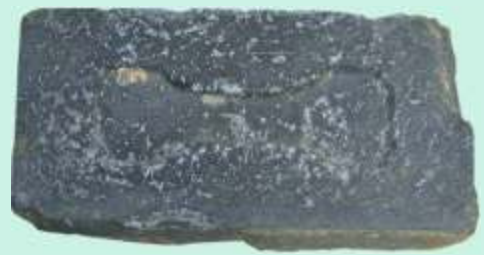
Above: A 'blue brick' (UMA)

A curious variety of finds have been dredged up from the Isle of Wight dredging region. These finds range from bricks, bones, plaques and even a number of forks and spoons, although strangely we have yet to receive any knives! UMA have stated that these finds have come from a large spread of rubble extending from south of the Portsmouth coast to the west of Nab Tower. It is thought that this rubble accumulated due to the dumping of domestic scrap or demolition debris following WWII. At present we are unable to conclusively identify the source of this rubble, but are continuing to investigate its origin. Recent finds from the area discovered by Arthur Farmiloe at UMA's Bedhampton wharf are inscribed with a Broad Arrow, a symbol used to mark items belonging to the Royal Navy. As such, the possibility of a wreck in the area is not ruled out!