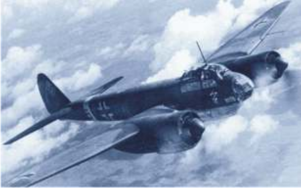
Junkers Ju 88 aircraft

Building on the success of the reporting scheme is the new “Aircraft Crash Sites at Sea” project, funded by English Heritage through the Aggregate Levy Sustainability Fund. The discovery of a series of aircraft remains reported through the scheme has raised a number of issues to be explored by this new study.