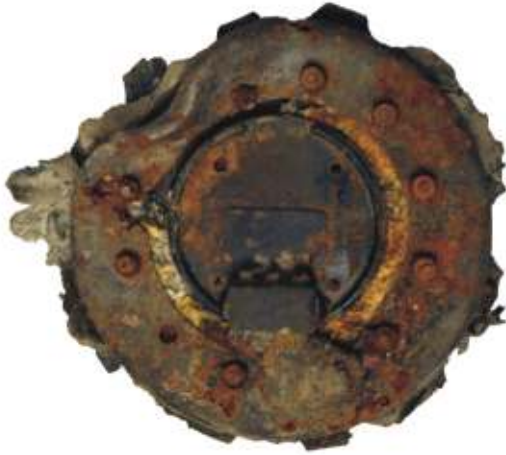
An aircraft fuel gauge (Hanson)

Finds from dredgers and wharves continue to be reported at a steady rate and the variety of material is very encouraging. An artefact described as the back of an aircraft fuel gauge was found at Hanson's SBV wharf in material dredged from licence area 242, about 24km north east of Lowestoft. A closer inspection of the photograph revealed that the object was manufactured in Britain by S. Smiths & Sons (Motor Accessories) Limited, a company which manufactured fuses and aircraft instruments during the First and Second World Wars. This find may indicate that there is an aircraft crash site in the area so a close watch needs to be kept on material from this licence to ensure that any further wreckage is spotted. If more aircraft wreckage comes to light, we may be able to locate a crash site.