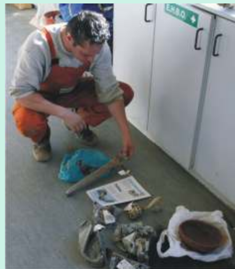
Right: A staff member of the Kallo Wharf in Antwerp examines some finds reported through the Protocol