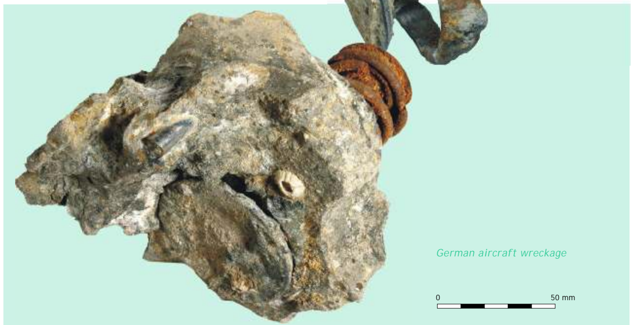
German aircraft wreckage