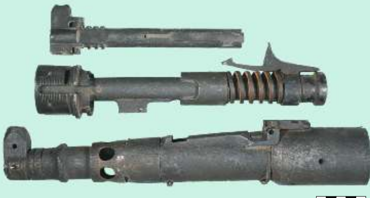
Above: MG15 Machine Gun