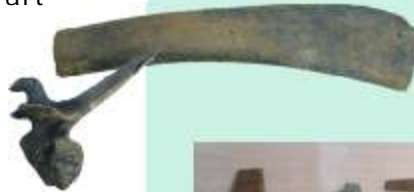
Below: Various artefacts from the Isle of Wight dredging region (UMA)