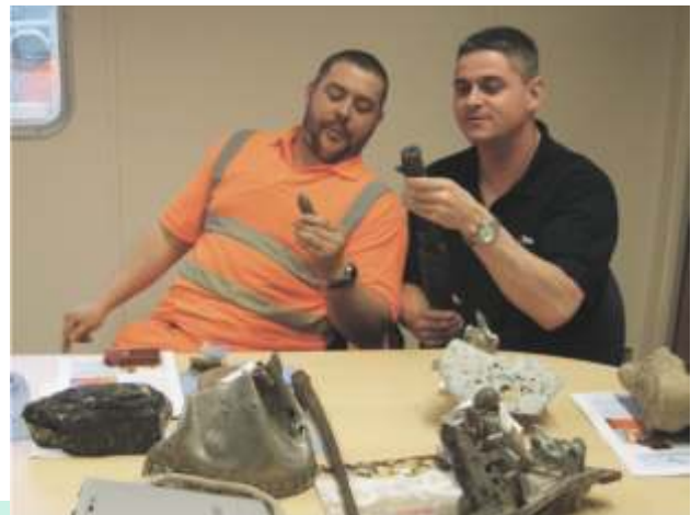
Staff at Bedhampton Wharf examining some of the finds reported through the protocol

The Implementation Service continues to be supported by the ALSF funded Awareness Programme to promote education and awareness. A regional workshop was held in Salisbury in September and for the first time, the scheme has been extended across the North Sea to wharves in Holland and Belgium.