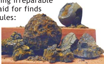
A Mary Rose Trust experiment demonstrates damage to cannonballs caused by improper conservation

Artefacts should be submerged in freshwater or seawater in a clean container, ideally with a close fitting lid, to stop water evaporating and debris falling in. Alternatively, float a sheet of plastic or tarpaulin on the surface of the water. If the object is too big for a container, wrap it in wet fabric and then in plastic or tarpaulin to prevent it from drying out. Do not wrap finds in tissue paper as it will disintegrate when wet. Care should be taken when handling wet artefacts: they often look more robust than they are.