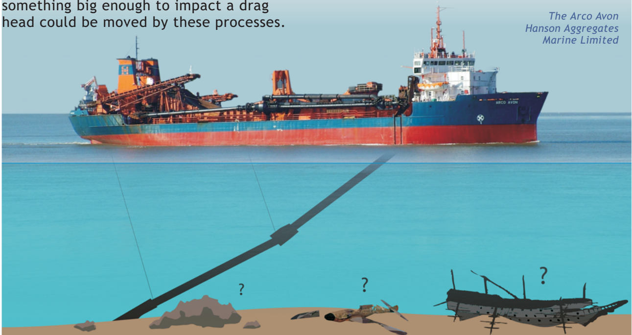
The Arco Avon Hanson Aggregates Marine Limited

The obstruction is currently thought to be a boulder deposited in this location by ice during a past ice age. A 50m exclusion zone has been established around it for the protection of ships working in the area and the protection of the presently unidentified anomaly. The exclusion zone and the nature of the obstruction will be reviewed during all further monitoring surveys in this area.