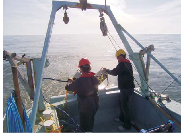
Wessex Archaeology staff deploying geophysical survey equipment to investigate Area 240

Following the reporting of significant Palaeolithic remains from Area 240 in the east coast dredging region by Hanson Aggregates Marine Limited (featured in Dredged Up issue 4), Wessex Archaeology continue to work on an extensive project in part of this licence area to locate and inform upon any areas of archaeological sensitivity. As part of this project, Wessex Archaeology has completed a month long geophysical survey and recently took samples of material from the seabed. The results of these surveys, which are designed to help inform future dredging licence applications, will be available on our website soon.