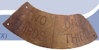
Ship's telegraph plate discovered by D. Whitby (CEMEX)

The timeline below illustrates how finds reported through the Protocol relate to the broad expanse of time from our ancestral predecessors to the modern day.