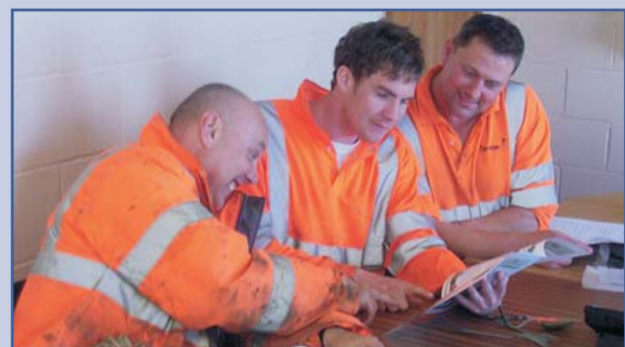
Staff at UMD's Shoreham Wharf learn about our heritage

The BMAPA/EH Protocol is the first of its kind in this country providing mitigation for the discovery of archaeological material during the course of marine aggregate extraction. In response to its success, other marine industries have begun to use the Protocol as a template for good practice during marine work. This demonstrates just how effective and useful the scheme is, which is entirely due to the hard work and dedication of aggregate industry staff.