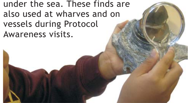
BMAPA/EH Protocol finds being used as part of Wessex Archaeology's outreach programme Time Travelling by Water

Many of the finds reported through the Protocol have been donated to Wessex Archaeology to use for teaching purposes. This is fantastic as marine archaeology is by its very nature highly inaccessible and many people might never have the chance to explore real finds that have come from under the sea. These finds are also used at wharves and on vessels during Protocol Awareness visits.