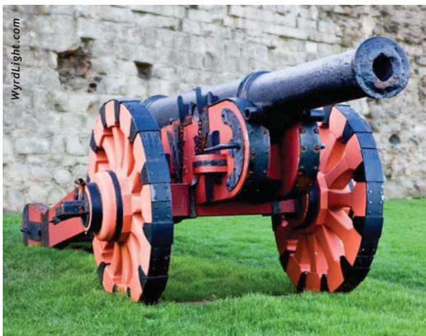
Demi-culverin circa 1587

It is important to remember that cannonballs dredged from the sea may have changed from their original size and weight due to damage caused either during firing or time spent on the seafloor.