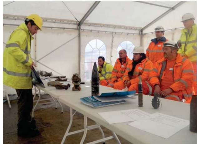
Safety day at Tarmac's Greenwich Wharf

Get in touch with the team on: protocol@wessexarch.co.uk or call 01722 326 867