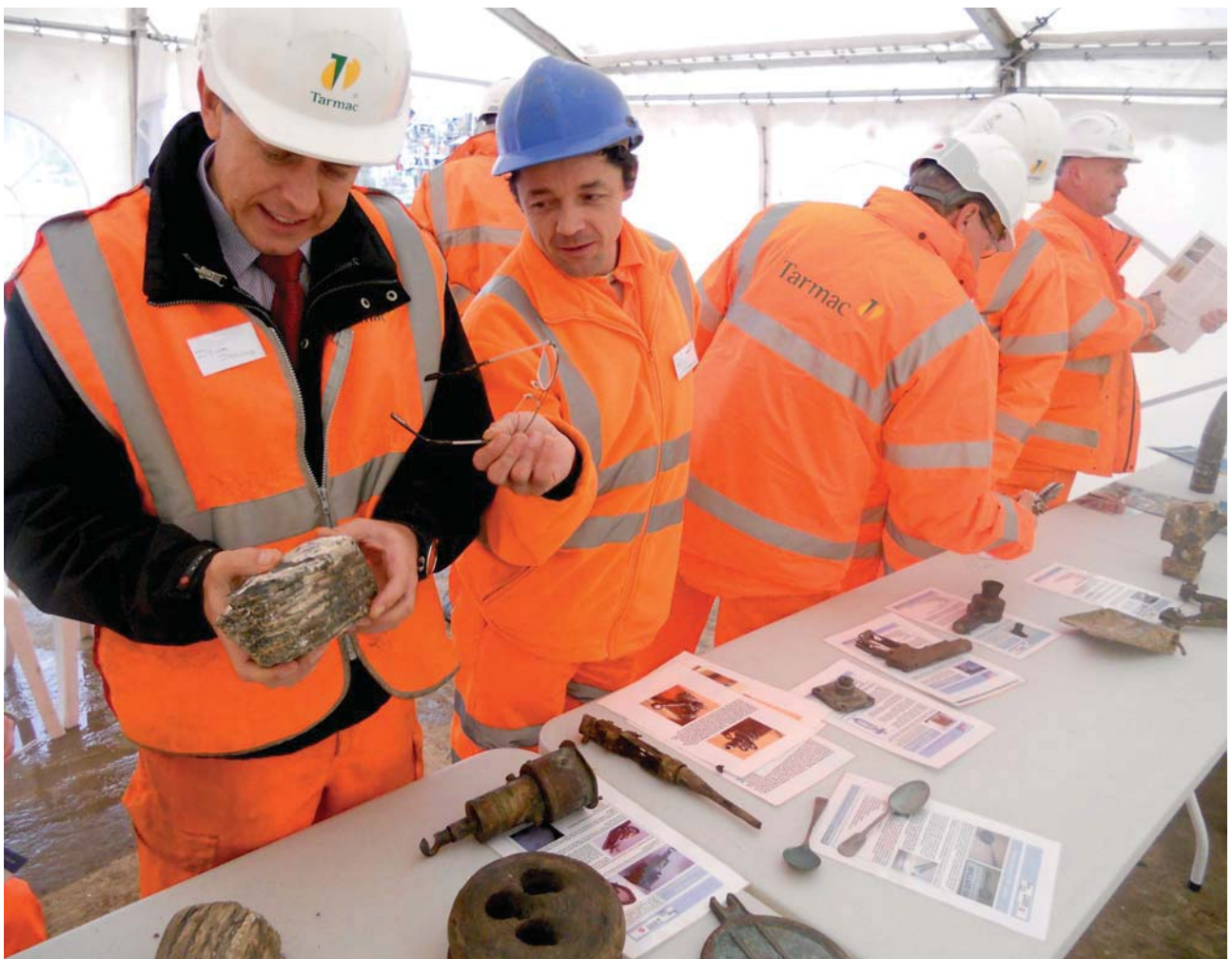
Tooth at Tarmac's Greenwich Wharf