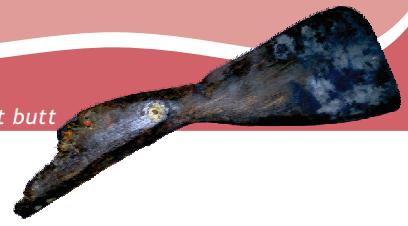
Matchlock musket butt