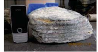
Original report photo (Tarmac)