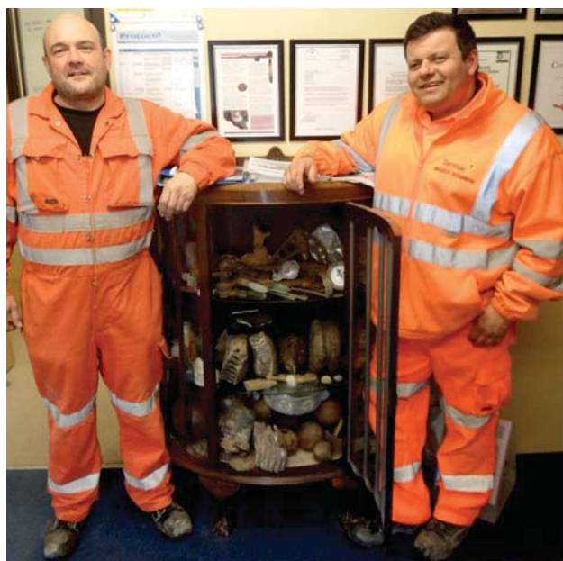
Site Champions at Greenwich Wharf

Best Find - Schermuly naval rocket line thrower