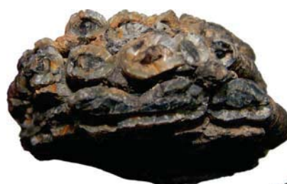
Mammoth Tooth - Mammuthus meridionalis