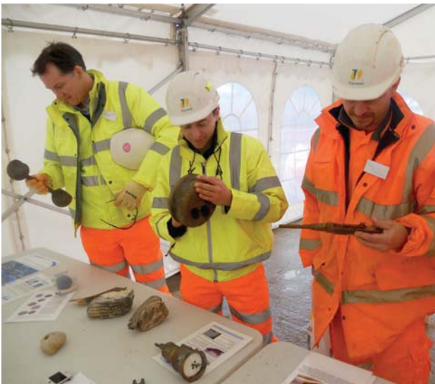
Safety day at Tarmac's Greenwich Wharf

Welcome to Issue 12 of Dredged Up, the newsletter of the BMAPA / TCE / EH Protocol Implementation Service.