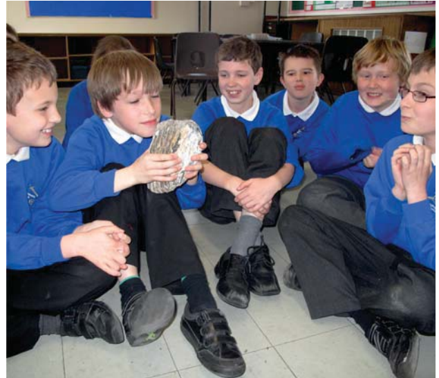
Tooth on a school visit

It has also visited wharves and been handled by wharf staff all around the country as part of the Awareness Visits that we deliver to support the Protocol. Find out more about these visits and how to book yours on page 8.