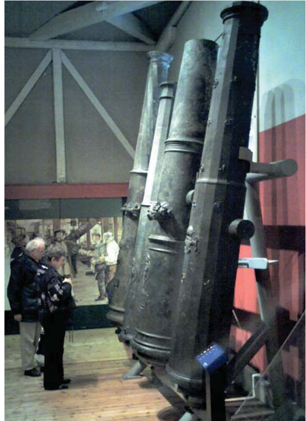
Front two demi cannon, back two culverins

Not all cannonballs are simply round shot. Others were adapted to cause maximum damage to an enemy's ship.