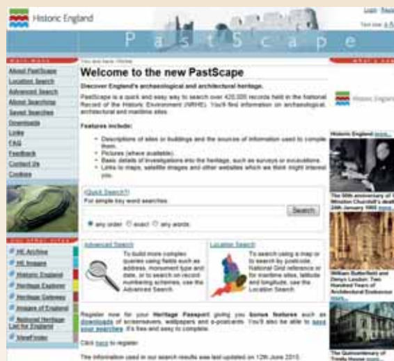
The PastScape website

I am responsible for the maritime component of the National Record of the Historic Environment (NRHE), which covers English territorial waters out to the 12 nautical mile limit. It includes over 37,000 wreck records, including approximately 6,000 identified wreck sites, and 31,000 known wreck events. The NRHE also includes almost 10,000 records relating to features other than wrecks, including records of unidentified obstructions and fishermen's fasteners, seabed finds that have not come from wreck sites, as well as prehistoric landscape features. The database is constantly updated as the identities of previously unidentified shipwrecks are revealed, and as new wreck sites are discovered for the first time.