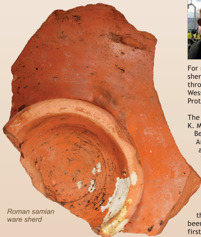
Roman samian ware sherd