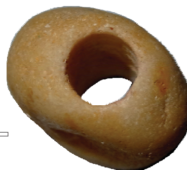
approx. 5 mm

Reports from the Marine Aggregate Industry Protocol are a vital source of information for helping us to improve the records. We also make use of other sources of information such as data from the Receiver of Wreck, the UK Hydrographic Office and from members of the public, as well as including the results of research in to primary sources such as historic newspapers and U-boat logs. The NRHE is freely available to browse via the PastScape website, which can be found at www.pastscape.org.uk . I really enjoy receiving the Protocol reports. The variety of material that has been discovered and reported is amazing. I think that the discovery of a glass bead (LTM_0527) has been particularly fantastic as the bead is so tiny! I'm already looking forward to receiving the next batch of reports.